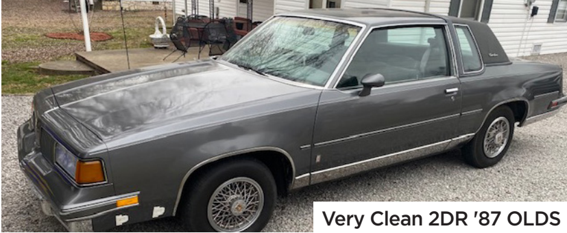
Very Clean 2DR '87 OLDS