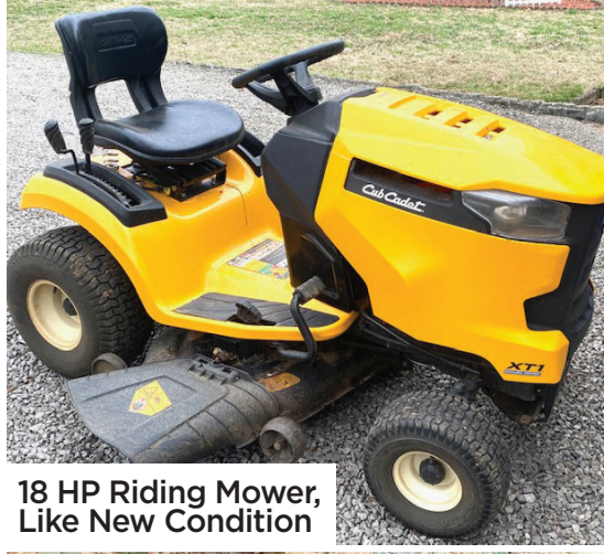
18 HP Riding Mower, Like New Condition