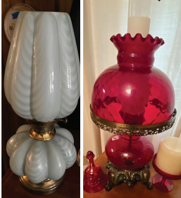
Several beautiful lamps!