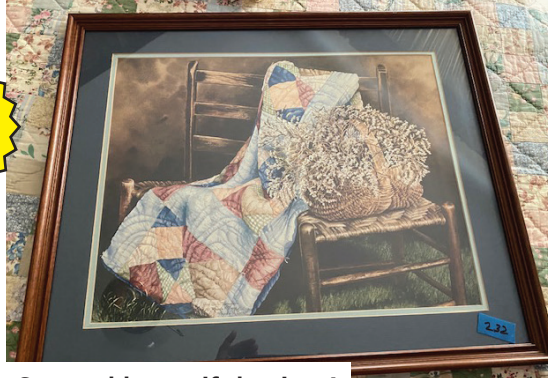
Several beautiful prints!

TERMS OF AUCTION: REAL ESTATE: 15% deposit, balance with delivery of deed on or before 30 days. A 10% BUYERS PREMIUM ADDED TO FINAL BID ON REAL ESTATE ONLY. PERSONAL PROPERTY: Payment in full at time of sale. Information herein obtained from sources deemed to be reliable, however accuracy is not guaranteed. ALL REAL & PERSONAL PROPERTY SELLING "AS IS" "WHERE IS" Bidders inspect all REAL ESTATE & PERSONAL PROPERTY PRIOR TO BIDDING.