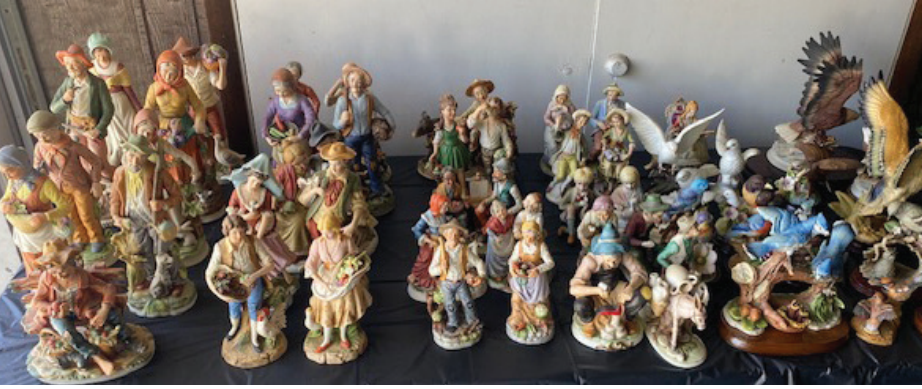
HUNDREDS OF FIGURINES JUST LIKE THIS!