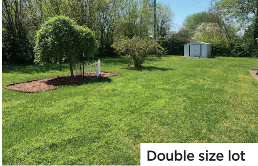
Double size lot