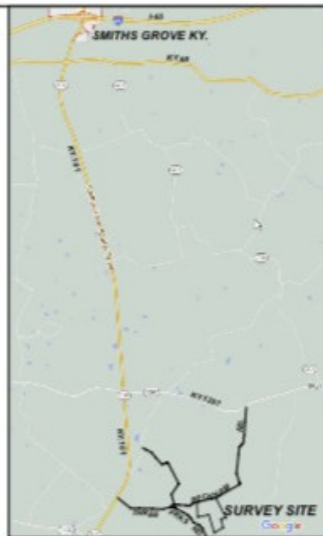
VICINITY MAP NO SCALE